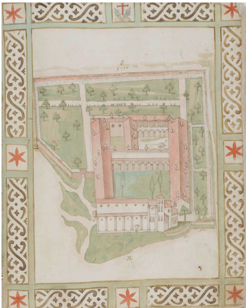
1. Archivio Storico Diocesano di Lucca (d'ora in poi ASDL), Archivio Arcivescovile di Lucca (d'ora in poi AAL), Enti Religiosi Soppressi , n. 2, Monastero di San Ponziano in Lucca.

As for the Church power, the reorganization of the property took place with the Council of Trent, in order to avoid the erosion of the patrimony of the Church itself, compromised by the other strong pow-