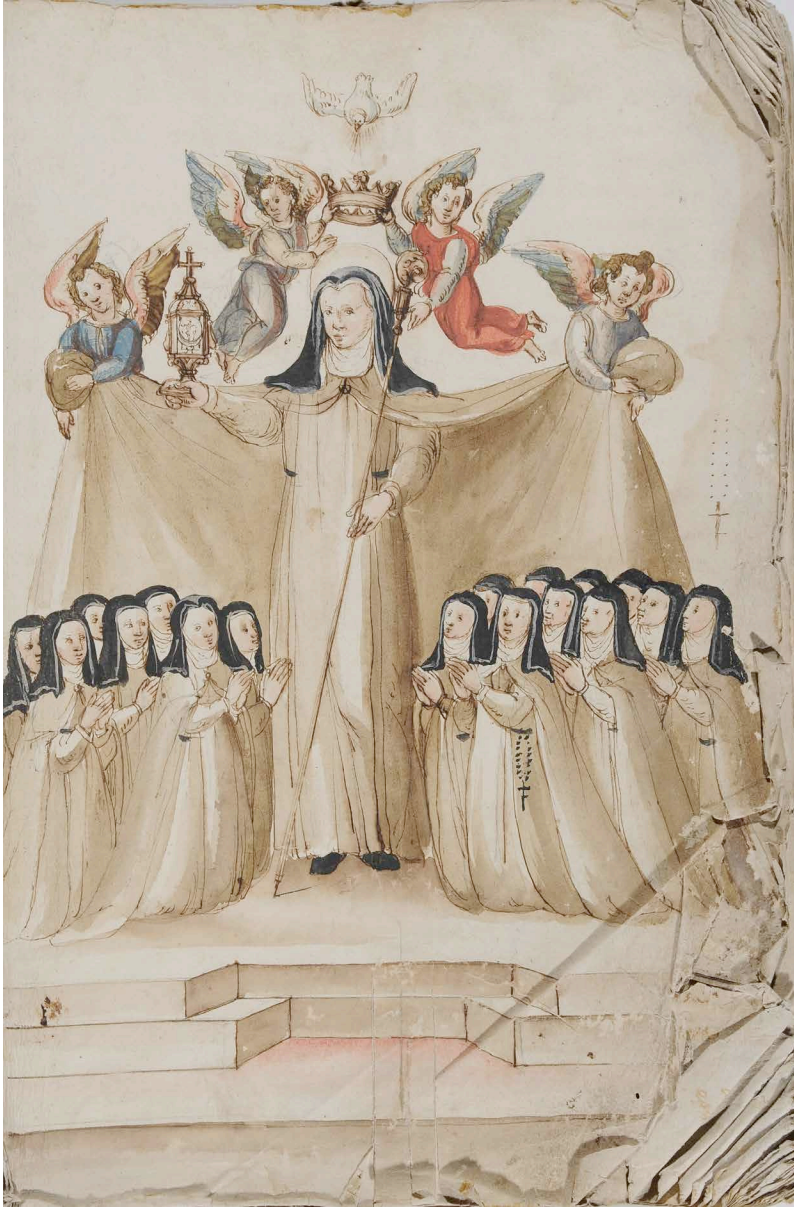
2. ASDL, AAL, Enti Religiosi Soppressi , n. 2442, Convento di Santa Chiara in Lucca.

ers. Because of this it was given a pushing up in the production of large inventory registers on the model of the terrilogi of the noble families of Lucca. So, as a result of political-institutional happenings and also because of private people's will, the stores of the Historical Diocesan Archives of Lucca began to include gradually more and more terrilogi.